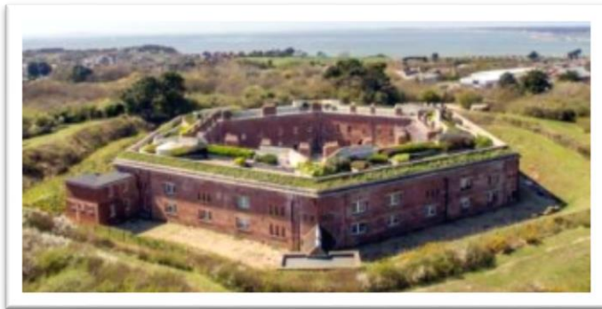
Golden Hill Fort

Golden Hill Fort in Freshwater was a barracks built between 1863-1872. and had its own hospital.