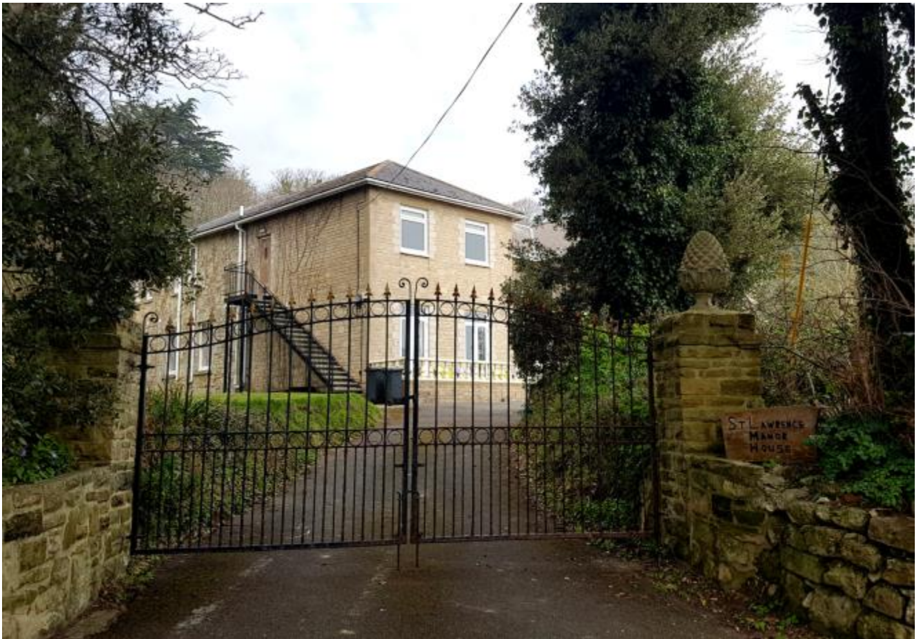
Photograph: St Lawrence Manor (Underwath House) 2019.

In the 31 May 2013 the County Press reported a request for a change of use was submitted to the Isle of Wight Council from a hotel to private residence. The Underwath had now also been renamed to St Lawrence Manor.