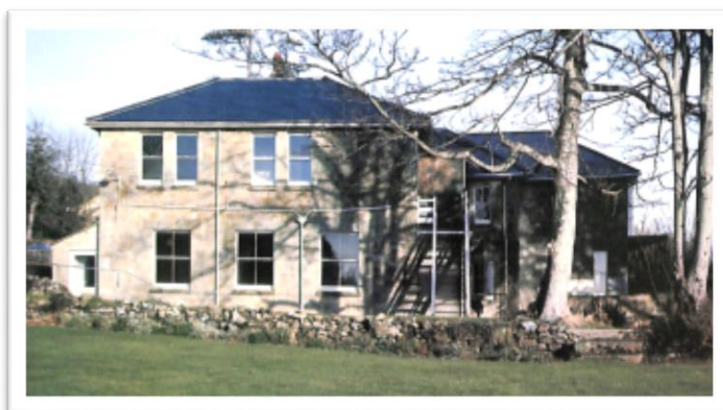
Underwath House.