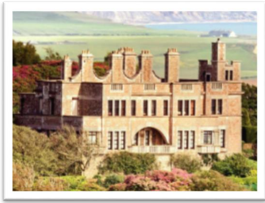
Brook Hill House

Four additional hospitals were also used during WW1 however these were not run by the Red Cross and did not have VADs working in them.